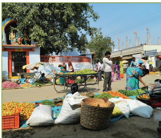
Food vendors at a marketplace in Mahabubnagar District, Telangana.

Interestingly, among only samples taken from household storage, there was no observable difference between the three origin categories (homegrown, marketplace, PDS), suggesting that the bulk of mycotoxin accumulation across these diverse food systems is occurring in the storage environment.