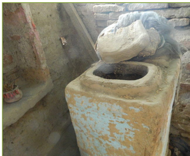
A mud-lined traditional grain storage structure.

Traditional storage methods are a complicated issue to tackle. Despite their cultural value, they are often very vulnerable to spoilage by pests and molds. Some of the storage containers observed in our preliminary survey were important multigenerational fixtures in the household. Customary storage containers are not inherently less effective for preserving food, but rather they are often in disrepair, insufficiently engineered, or improperly managed due to lack of directed support.