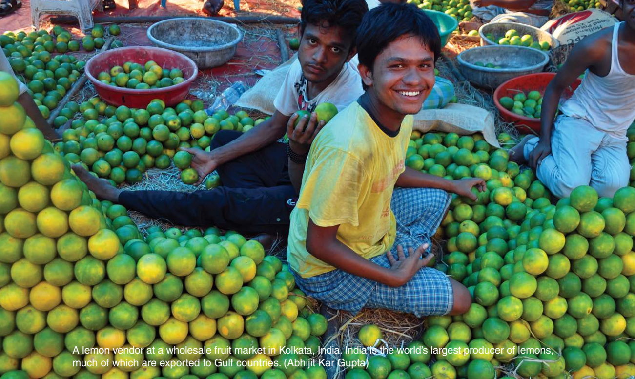
A lemon vendor at a wholesale fruit market in Kolkata, India. India is the world's largest producer of lemons, much of which are exported to Gulf countries.